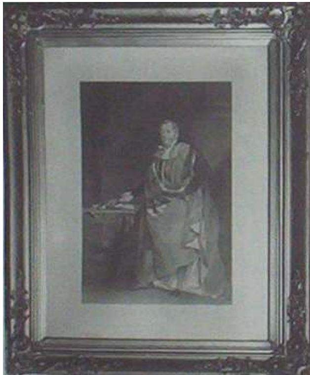
264 The Earl of Zetland, Grand Master