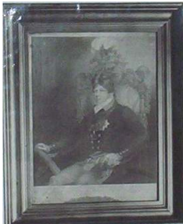
265 H R H The Prince of Wales