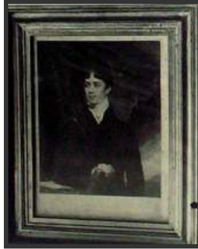
John George Lambton First Earl of Durham

To search for accurate information respecting the ownership of the large 'Oil Painting of the First Earl of Durham' which, although recorded as the property of Palatine Lodge has been challenged.